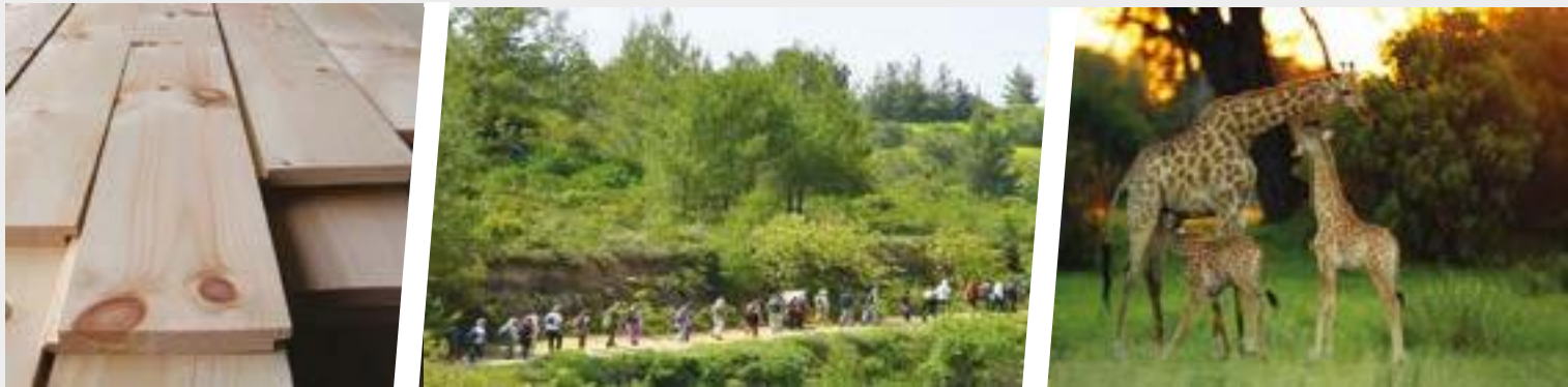
Strategies for revenue sharing

SCL offers studies, plans, policies and strategies to African countries as one of the ways to improve their economies.