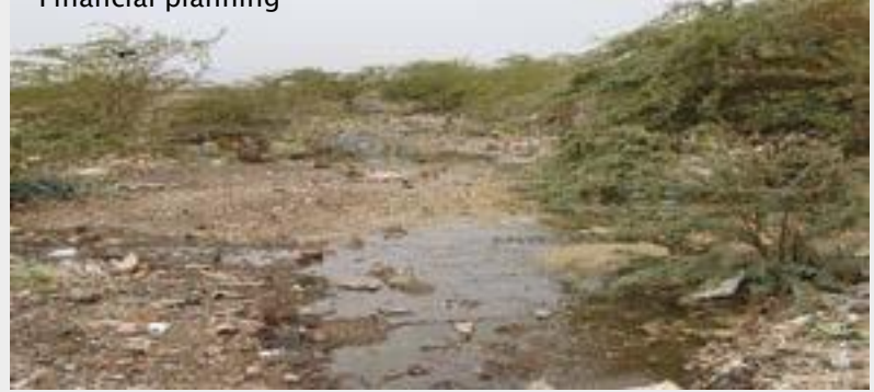
Environmental remediation of such areas