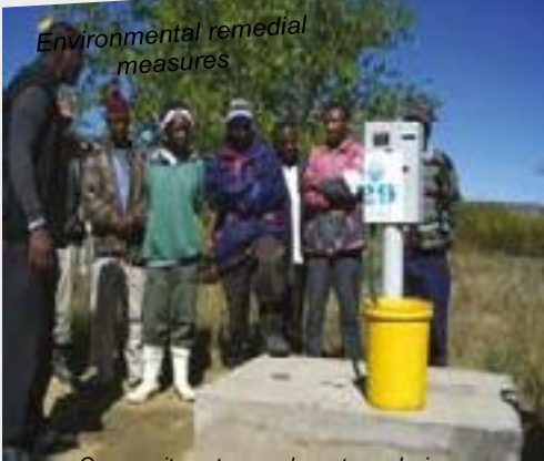
Community water supply systems design