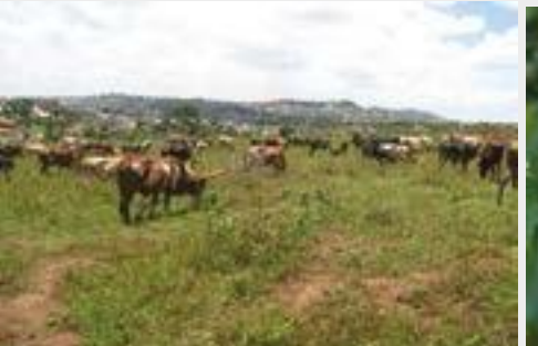
Live stock Breed and pasture Improvement programmes